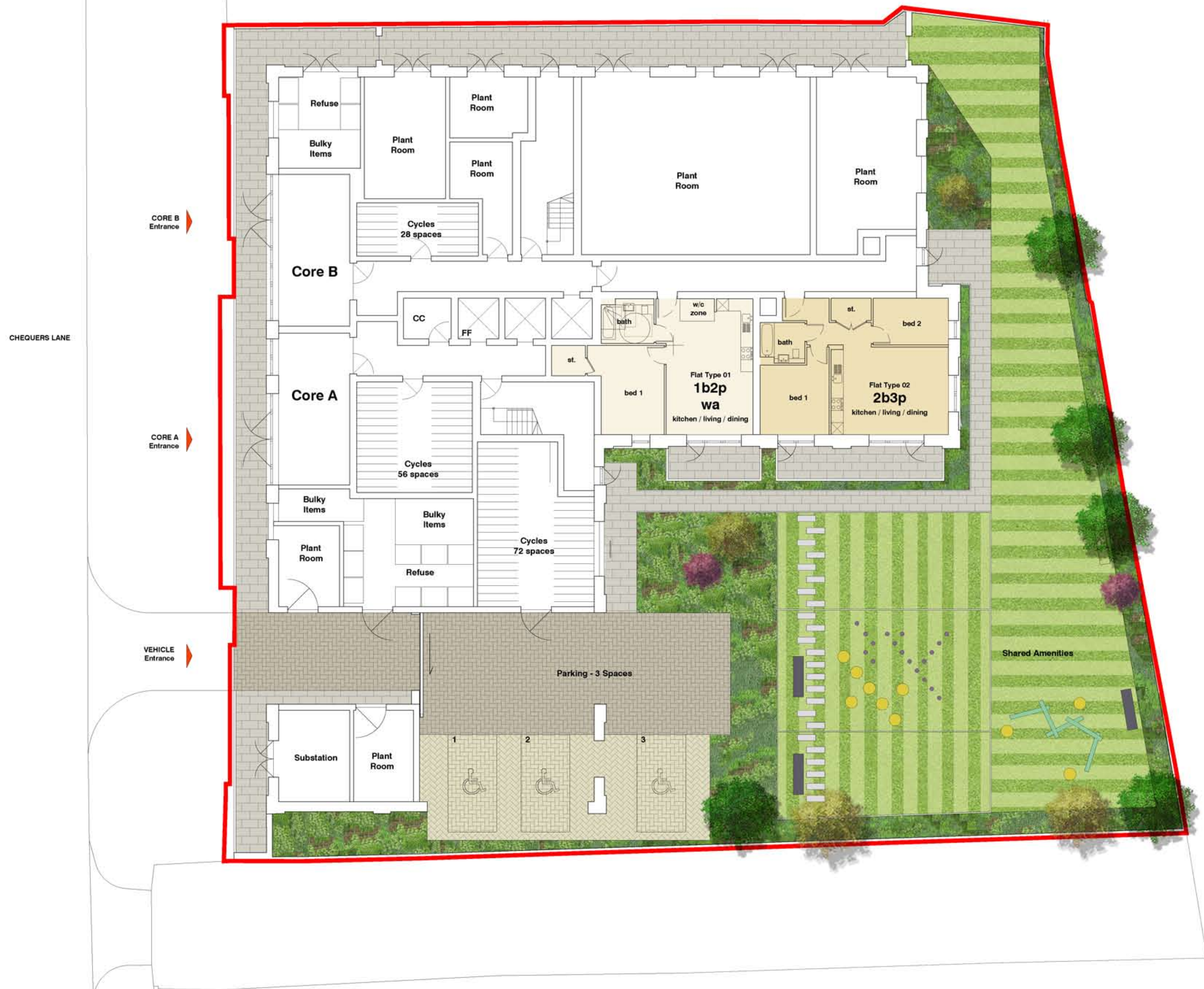
SITE PLAN - WITH GROUND FLOOR PLAN. Proposed