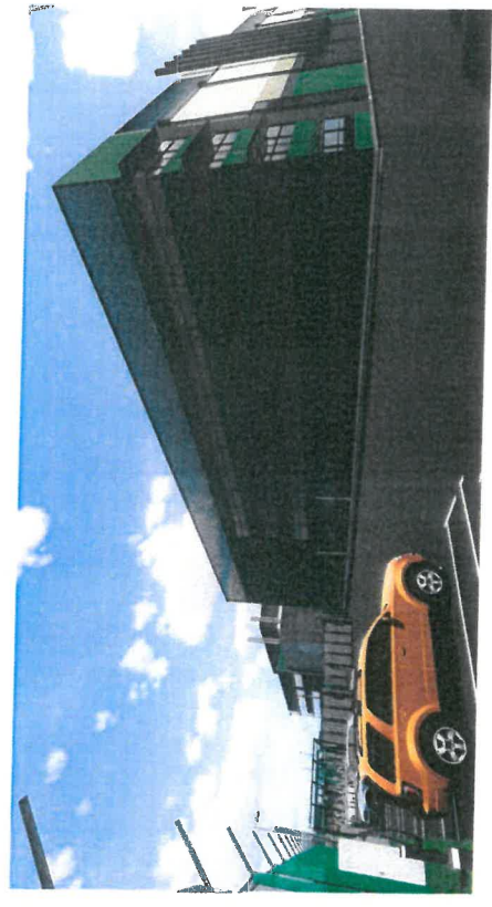
④ Phase 2 - Building Visual 4 1:1