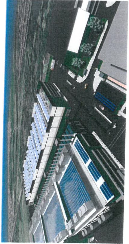
③ Phase 2 - Building Visual 3 1:1