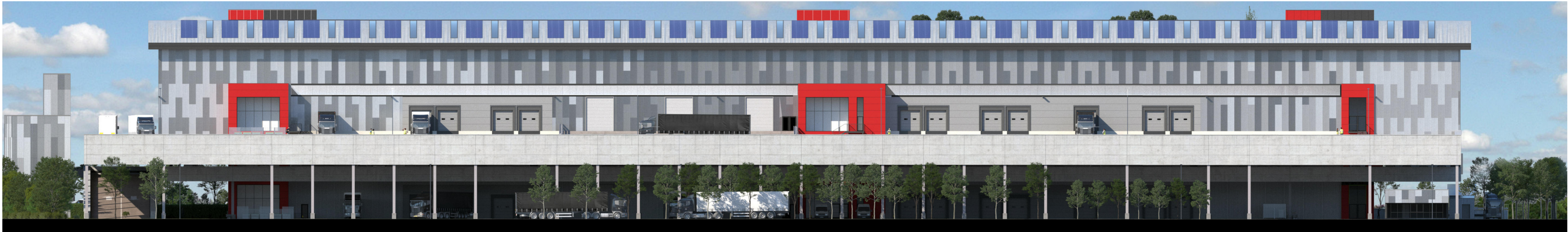
02 WEST ELEVATION 212