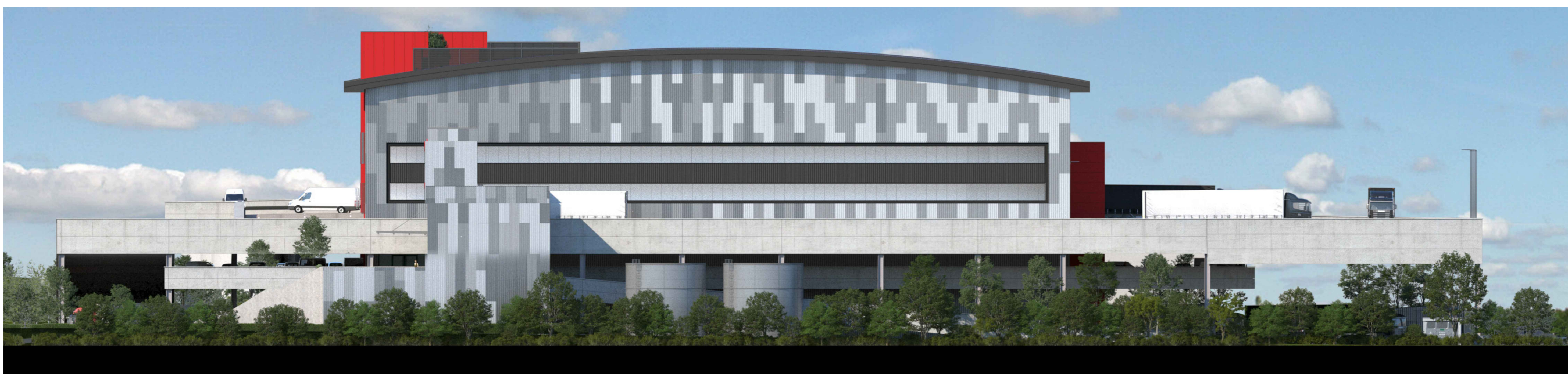
04 NORTH ELEVATION 212 1:200