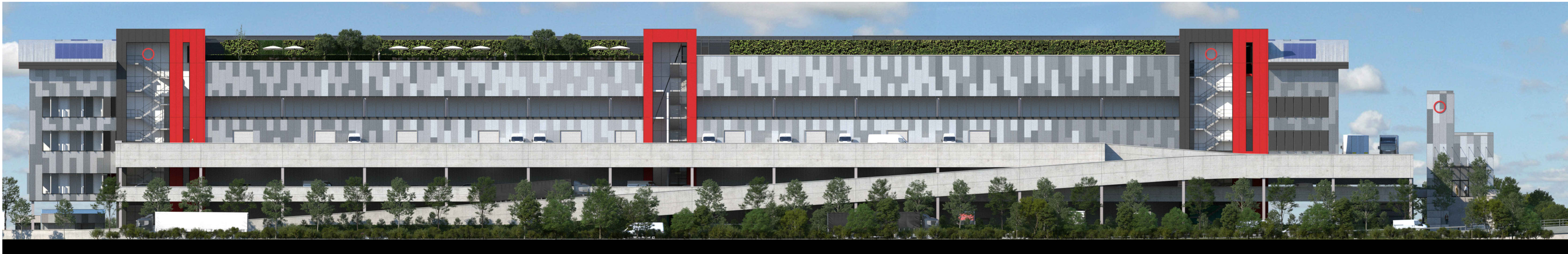
01 EAST ELEVATION 212 1:200