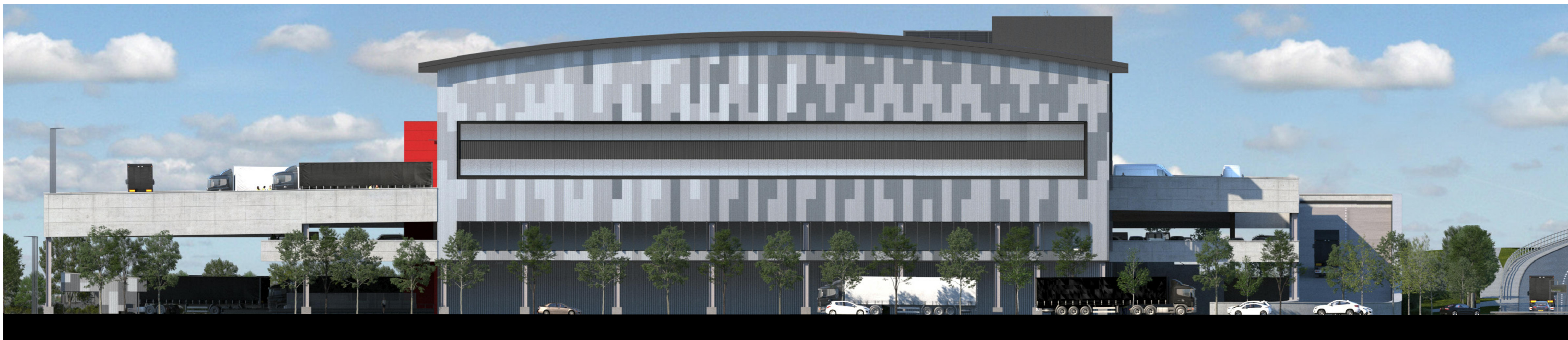
03 SOUTH ELEVATION 212 1:200