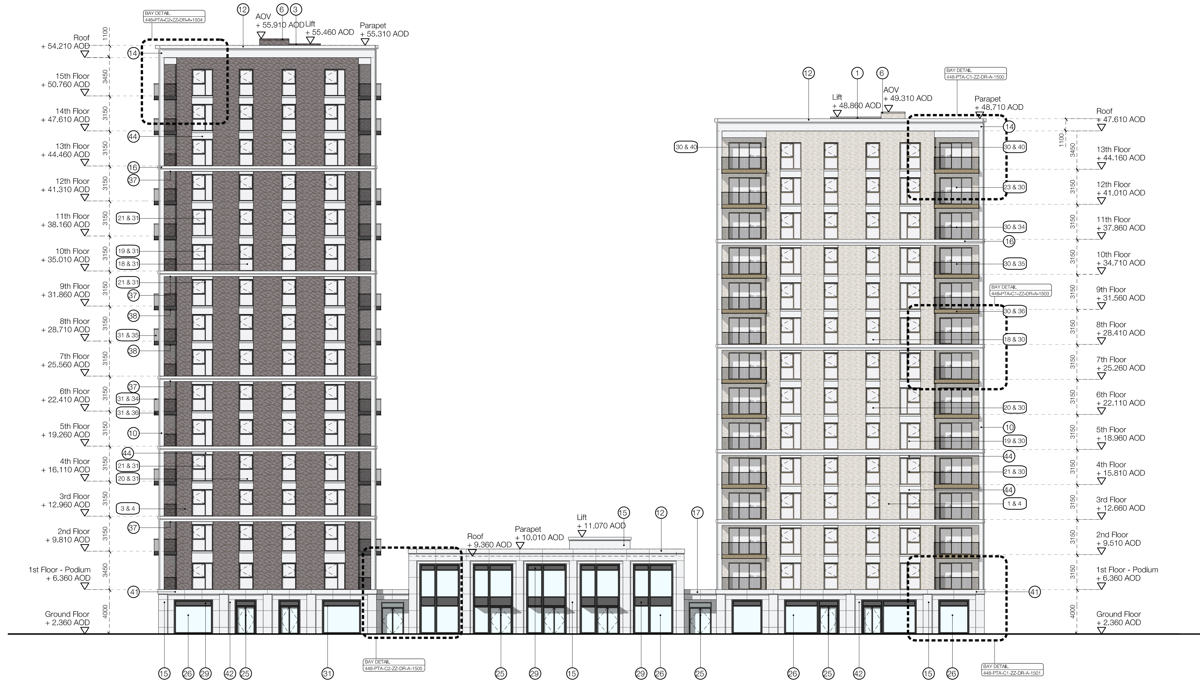
01 Elevation A-A 1:210

General Notes DO NOT SCALE. All dimensions must be checked on site, errors are to be reported.