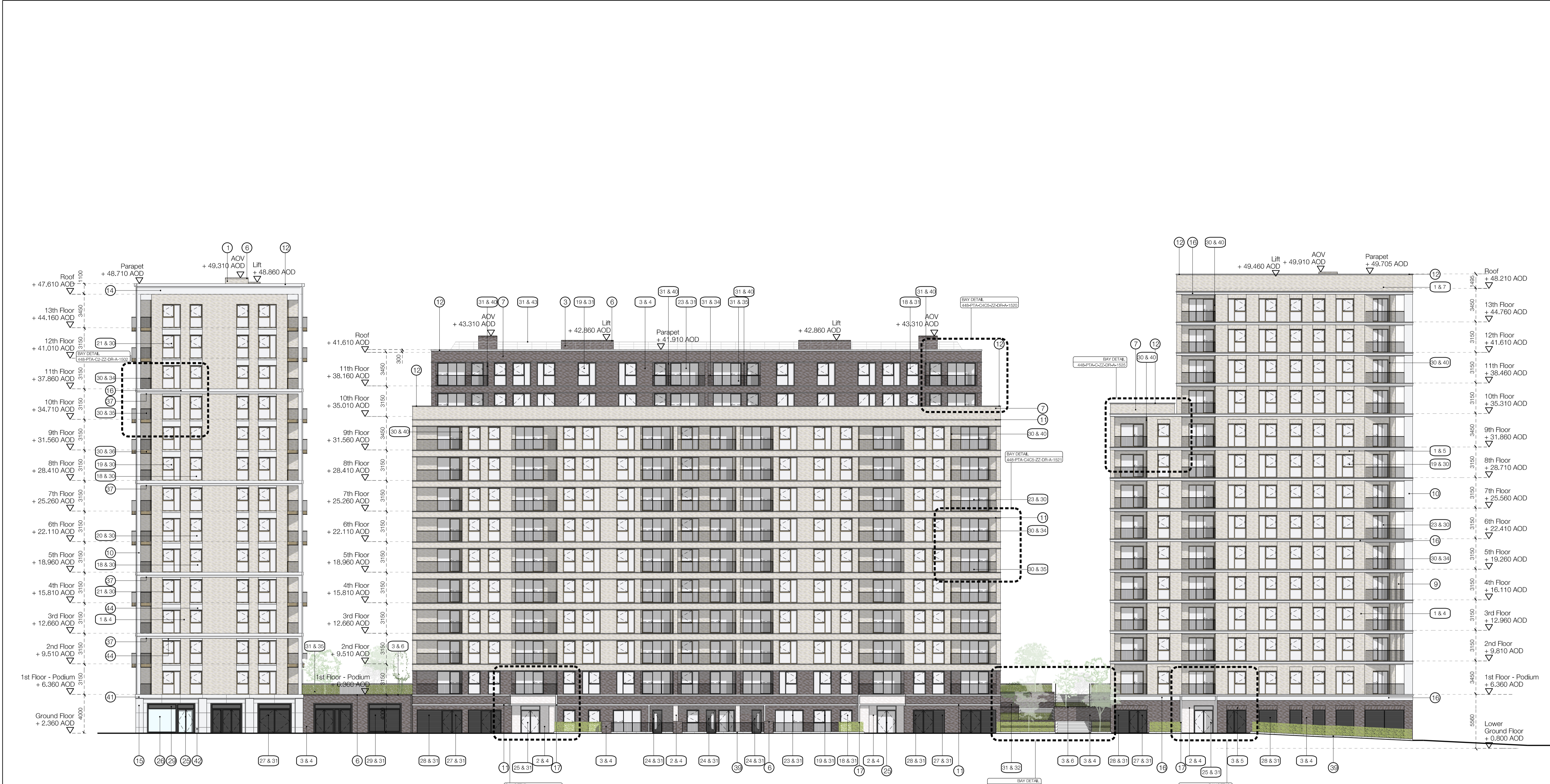
01 Elevation D-D 1:210

General Notes DO NOT SCALE. All dimensions must be checked on site, errors are to be reported.